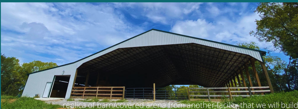
replica of barn/covered arena from another facility that we will build